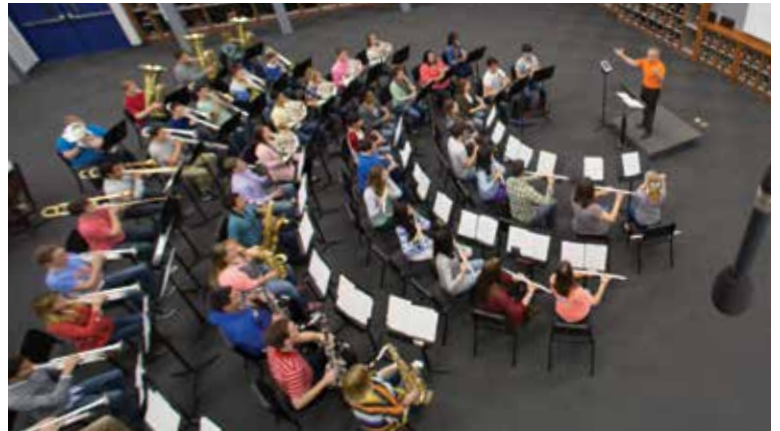
FOR PRACTICE SPACES