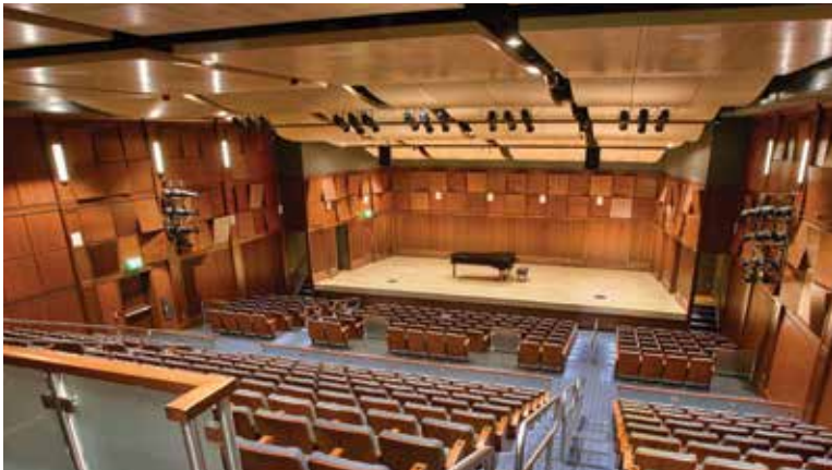
FOR PERFORMANCE SPACES